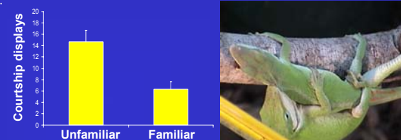
Figure 1. Physical contact experiment results. Each bar represents the mean number and standard error of courtship displays of males toward unfamiliar and familiar females on twelve trials.

In the Physical contact experiment, males courted unfamiliar females more frequently than familiar females. The number of courtship displays toward familiar and unfamiliar females supported the rejection of the null hypothesis (Wilcoxon's signed-rank test; T=75 p<0.01 ). The mean number of courtship displays toward familiar females (6.3) was different from that with unfamiliar females (14.6). Figure 1.